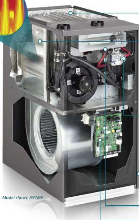
Model shown A97MV